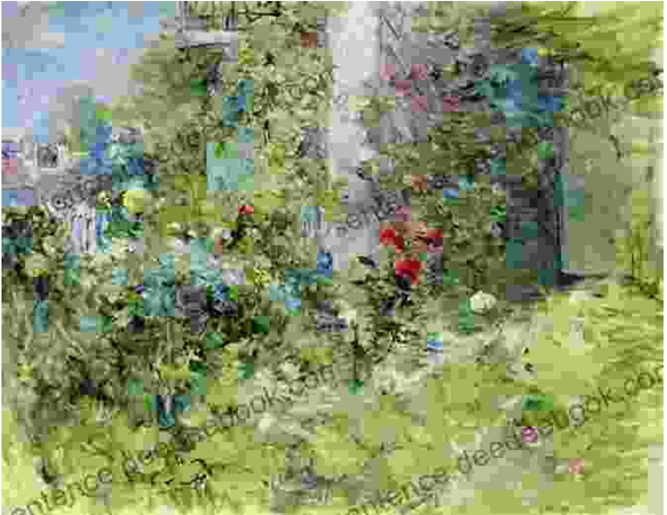
The Garden at Bougival (1884): Sunlight dances through the foliage in this idyllic scene, where children play and adults converse, capturing the carefree spirit of the Impressionist movement.