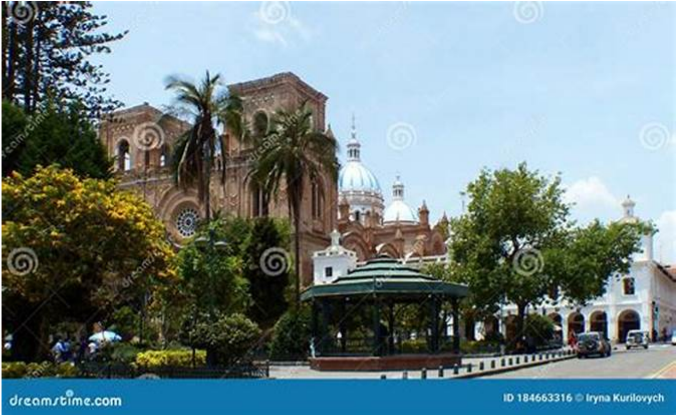
Parque Calderón, Cuenca, Ecuador