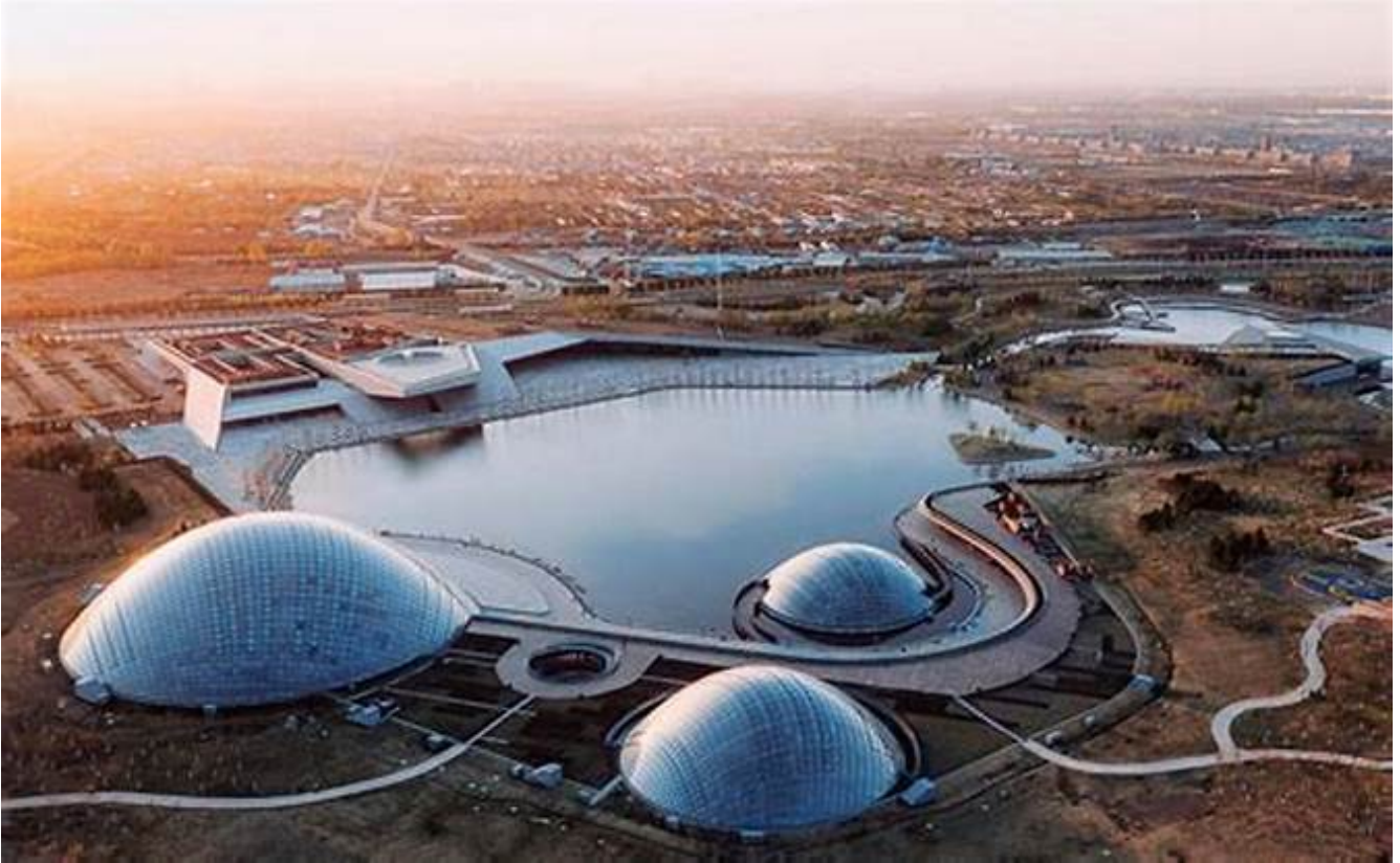
Jardín Botánico de Cuenca, Cuenca, Ecuador