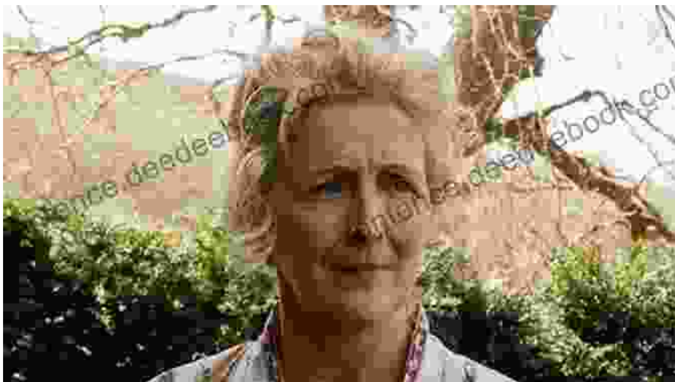
Fiona Shaw as Katherine in 'Henry V'

"Katherine is a very complex character," Shaw said. "She's a strong woman, but she's also very vulnerable. She loves her country, but she also sees the horrors of war. I wanted to play her as a woman who is trying to make sense of a very difficult world." Shaw's performance was once again praised for its depth and sensitivity.