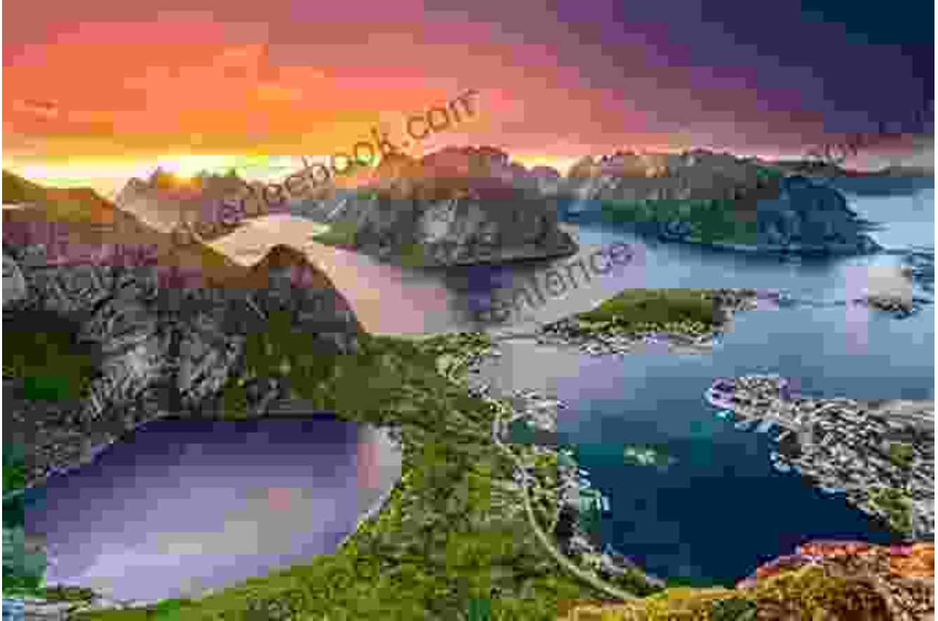
The Lofoten Islands

opportunities for hiking, fishing, and kayaking. There are also several small towns and villages on the islands, where you can experience the local culture and history.