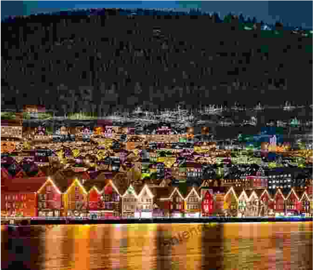
The Bergen skyline