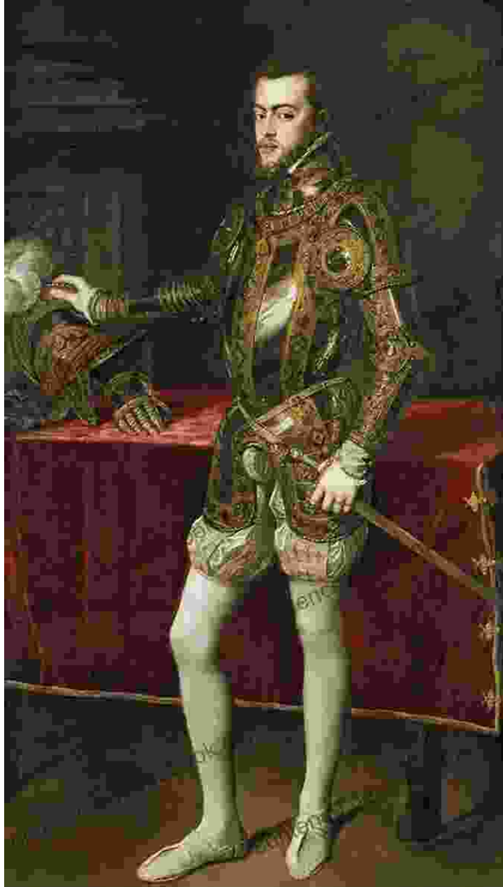
The Spanish Armada