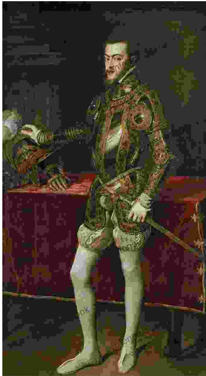
Portrait of Philip II of Spain by Titian