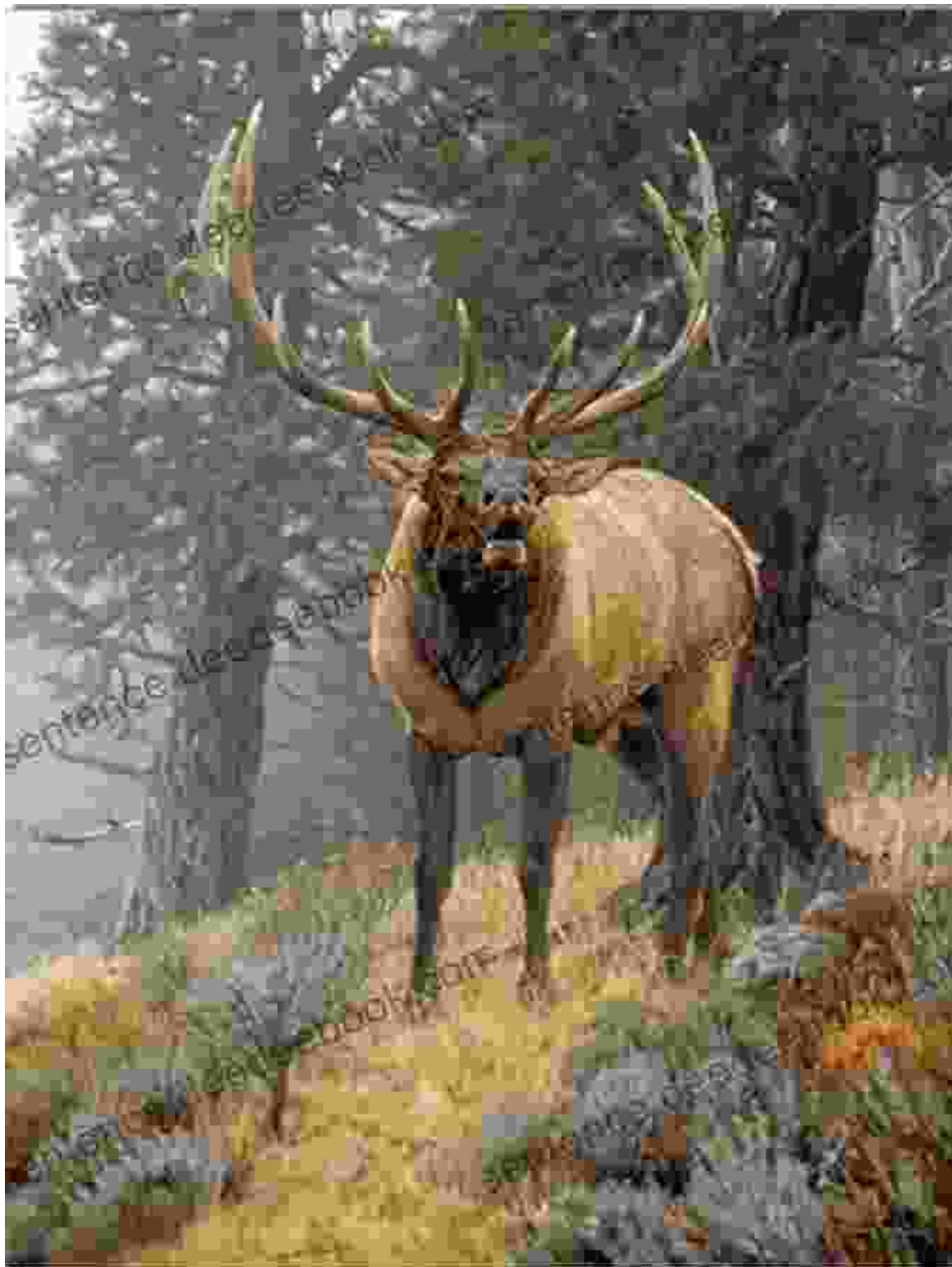
Painting of an elk by Western artist Frederic Remington

Elk also became a popular subject matter for Western artists in the 19th and 20th centuries. These artists often depicted elk in their natural habitat, with a focus on the animals' beauty, strength, and grace.