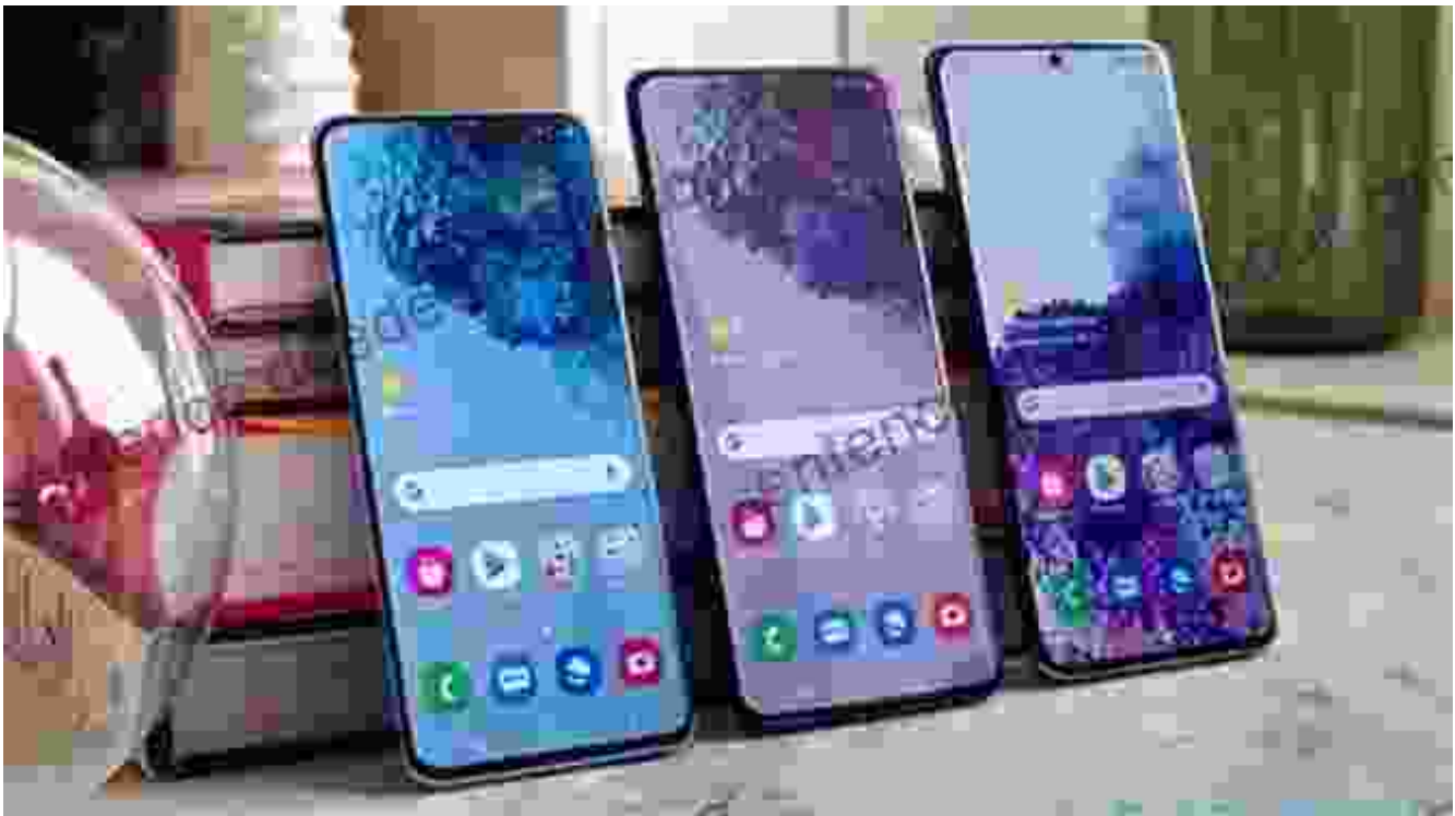
Samsung Galaxy S22 Display: A Feast for the Eyes

Immerse yourself in exceptional visuals with the Galaxy S22 series' vibrant and expansive displays.