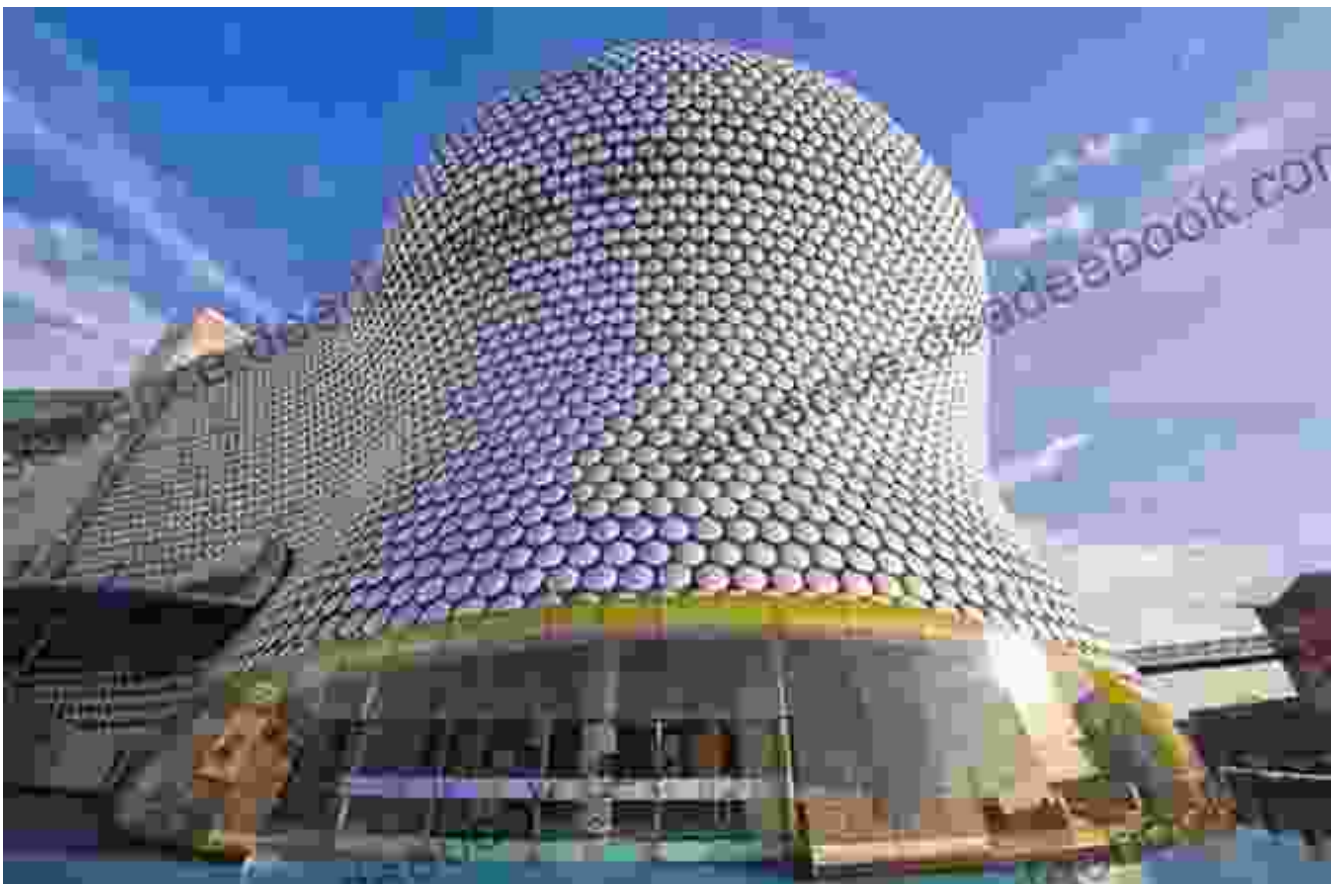
Unveiling the Hidden Gems of Great Britain

Explore the historic Jewellery Quarter, where centuries-old workshops and showrooms showcase the city's rich tradition in jewelry making. Stroll through the Bullring, a sprawling shopping center that seamlessly blends historic buildings with contemporary architecture, offering an unparalleled retail experience. Attend a performance at the Birmingham Symphony Hall, renowned for its world-class acoustics and hosting prestigious orchestras and soloists.