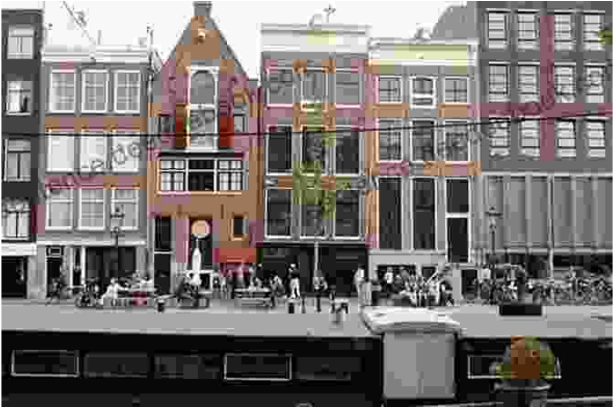
Anne Frank House, Amsterdam