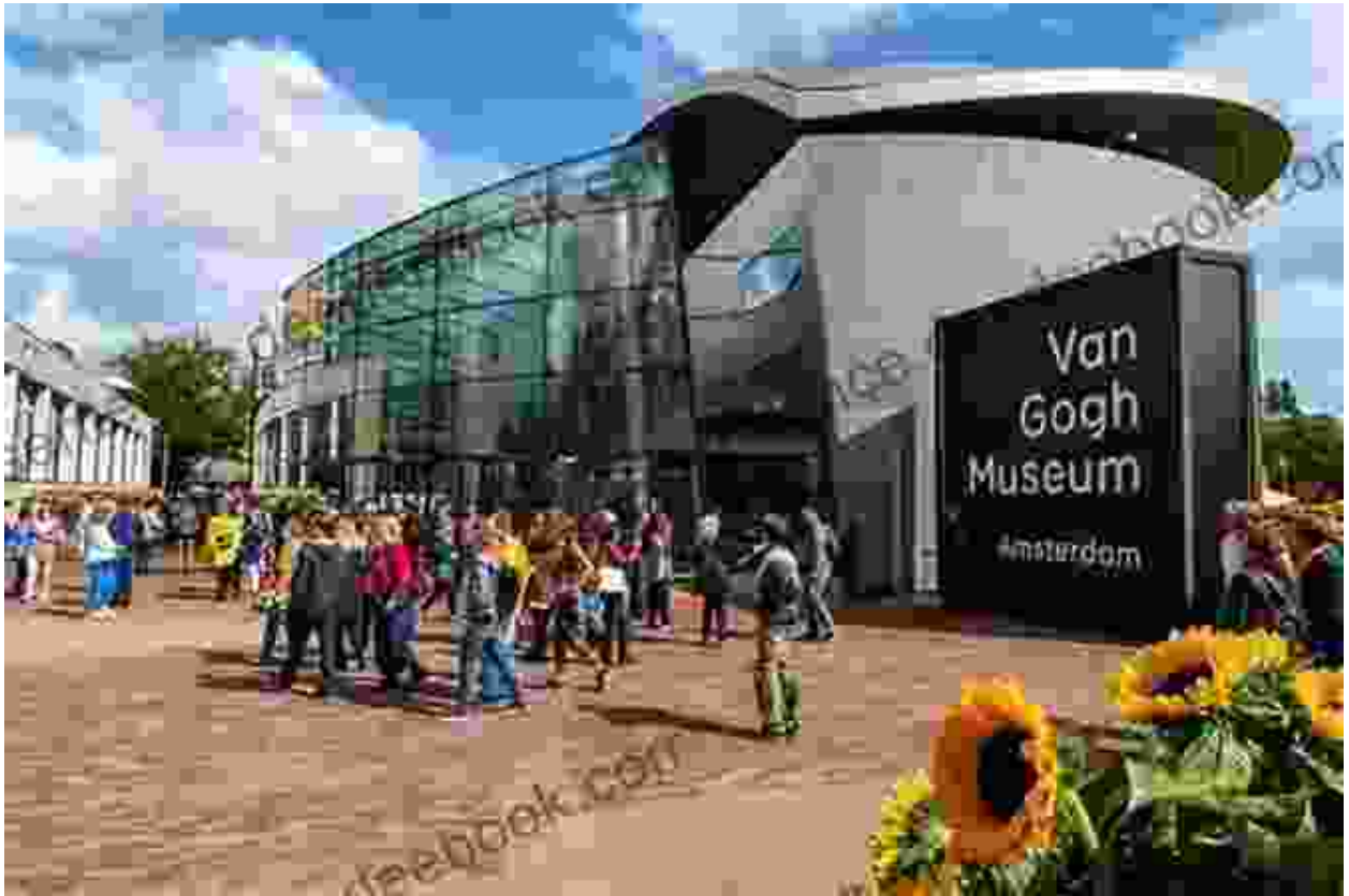
Van Gogh Museum, Amsterdam